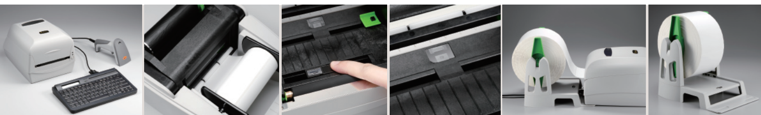
> Standalone mode with Argokee